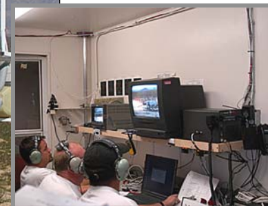
A recent propulsion ground test.

➤ A mobile ground station is used to monitor rocket motor tests and all flight tests. Staffed with test engineers, it provides real-time T/M data monitoring & recording of flight parameters. The spaceship's avionics displays are duplicated on a Mission Control monitor.