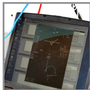
SpaceShipOne's avionics display is duplicated in Mission Control.