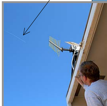
Telemetry antenna automatically tracks the White Knight.